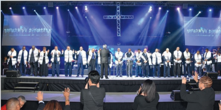
The 2016 Inductees

With an emphasis on churches being a strong pillar of the community, the Senior Pastoral Alliance of Southwest Louisiana recently inducted 30 Lafayette area Pastors into the Alliance. This is the first induction for the Alliance, whose mission is to work with and unite for the betterment of the entire community.