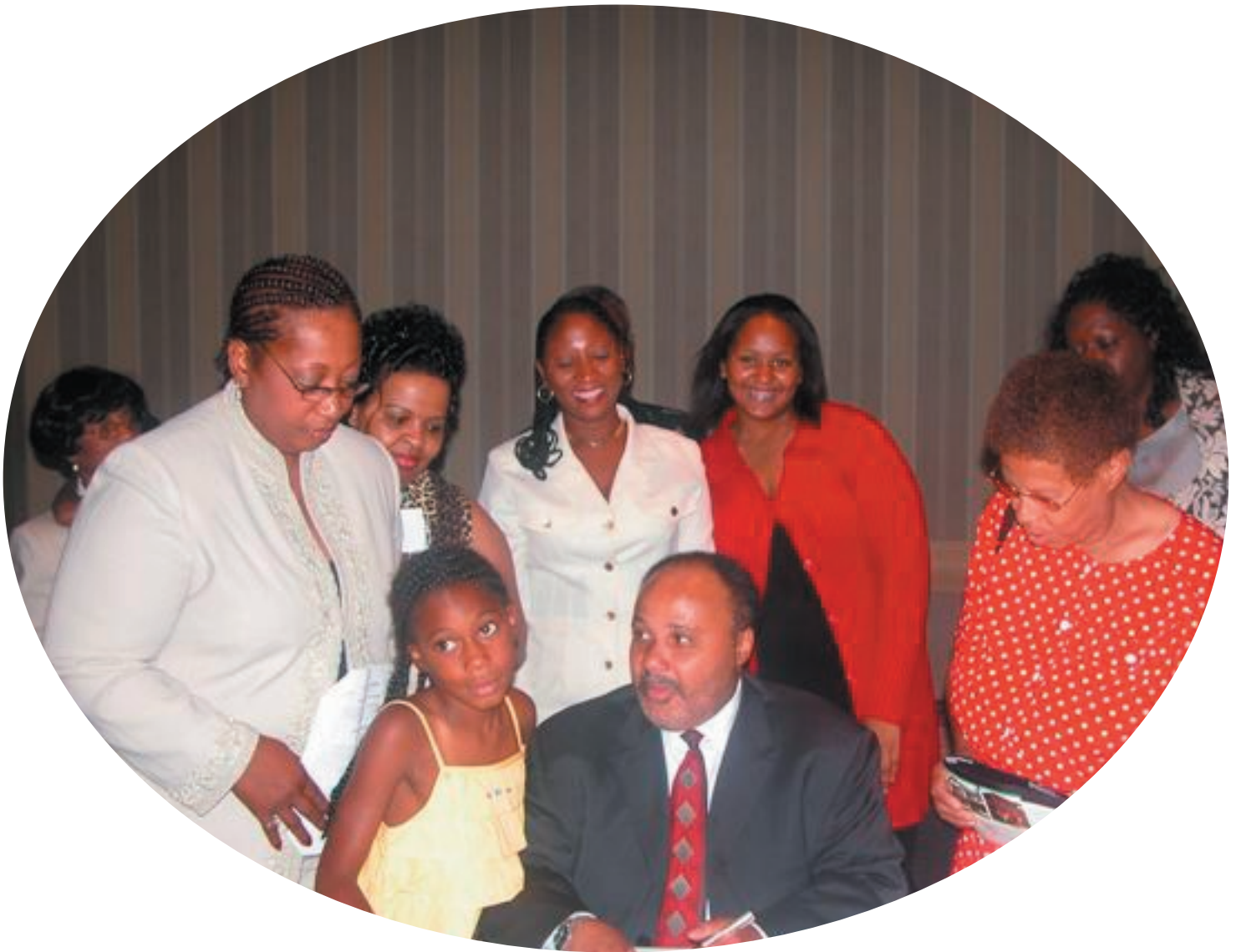
Martin Luther King III at the Chretien's Family Reunion in Atlanta, Georgia.

Faith & Soul News Magazine encourages you to support your local Martin King Jr. Holiday activities; please bring your children to the events. Let's continue to work together and love each other.