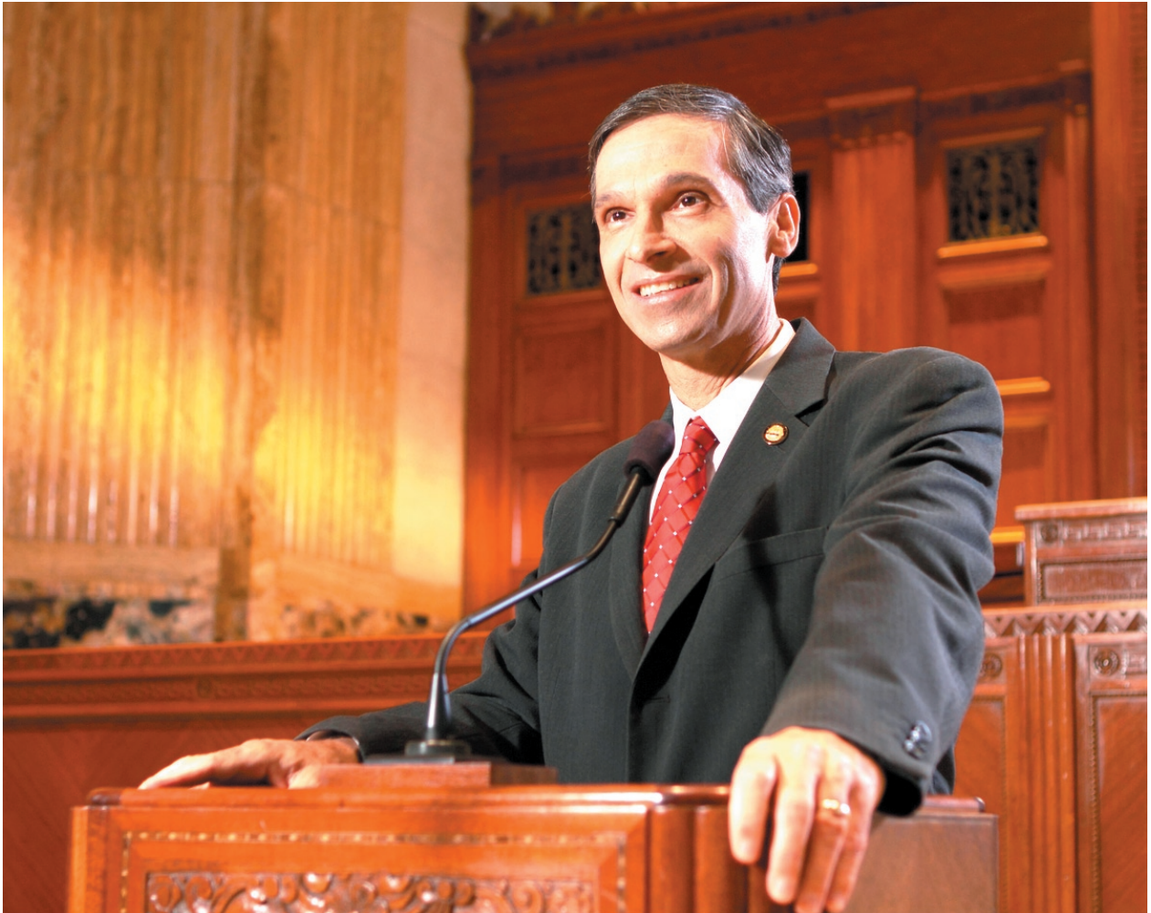
Above Senator Mills at the Louisiana State Capitol, Courtesy of Kelly Morvant Photography