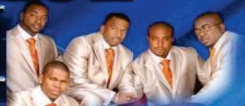
The Gospel Legends