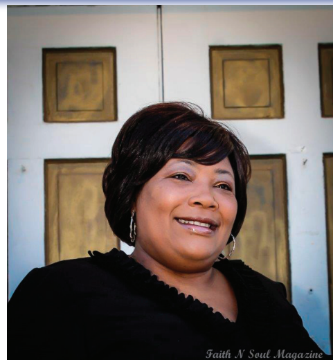
Mother - Born Great

It's nothing like the love of a mother. It's nothing that can replace the touch from a mother. There is absolutely no one that can take the place of a mother and no one can fill the space of a mother. When God made mothers him made them unique, rare and yes one of a kind. I am reminded of the scripture that states in Proverbs 31:10 that a woman of virtue is rare and her worth goes far beyond what anyone can measure.